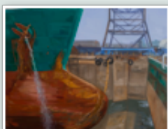
Rust Never Sleeps

DFN GALLERY New York City (Group Shows 2004, 2007)